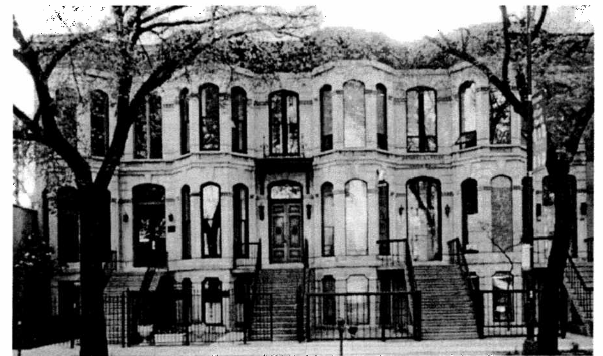
Surviving groups of Italianate-style row houses such as the Fremont Row House District are rare in Chicago. A significant remaining group is located on Chicago's Near North Side in the Chicago Landmark Washington Square District Extension, including (top) those at 827-33 N. Dearborn St. and (above) those at 802-08 N. Dearborn St.